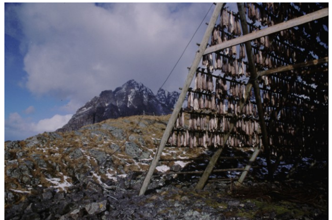
Cod drying on racks in Henningsvær, Lofoten, Norway

Overfishing is currently a major problem for many fish species, and the depletion of Canadian cod stocks due to overfishing during the early 1990s is an alarming example of how wrong things can go when overfishing occurs. These stocks suffered a total collapse. Today fishing in the northeast Atlantic is still banned, and there are signs that the cod are starting to return. Other species in the Arctic are also suffering from overfishing - both Barents cod and Bering pollock are suffering from comprehensive illegal fishing activities in addition to severe pressure on the fish.